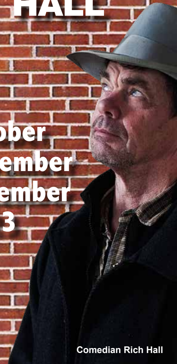
Comedian Rich Hall

MelkshamMarketPlaceSN126ES 01225 709887 • assemblyhall@melksham-tc.gov.uk