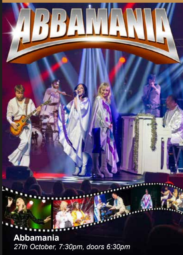
Abbamania 27th October, 7:30pm, doors 6:30pm

Europe's leading Abba tribute make their long-awaited return to Melksham with a sensational two-hour spectacular! Stunning costumes, a breathtaking stage show and pitch-perfect harmonies make these guys one of the world's most sought-after tributes to one of the most iconic pop groups of all time.