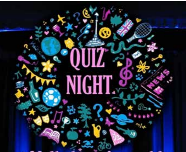
The Assembly Hall Quiz Night Last Thursdays, 7.30pm (doors open at 6.30pm) 25th January • 29th February • 28th March

Our quarterly record fair features sellers from across the South-West, and a huge variety of new and rare vinyl, CDs and tapes on offer. From first issues to reissues, and obscure rarities to those classics essential to any collection. Free entry, and the bar will be open!