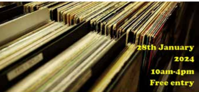
Melksham Record Fair 28th January, 10:00am – 4:00pm

Our quarterly record fair features sellers from across the South-West, and a huge variety of new and rare vinyl, CDs and tapes on offer. From first issues to reissues, and obscure rarities to those classics essential to any collection. Free entry, and the bar will be open!